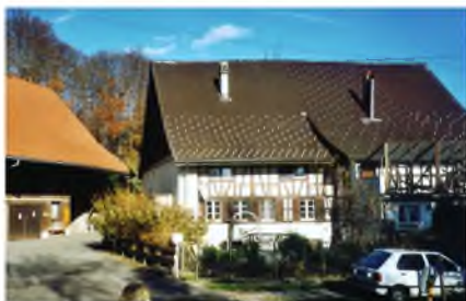
The Schweikhof , above Ebertswil in the Canton of Zürich, where my Huber ancestors lived.

The Anabaptists remaining in Switzerland stopped making proselytes. They accepted noncombatant military service, and the last active congregation in the Emmental, at Langnau, entered a peaceful partnership with Zwingli's Reformed Church in 1947.