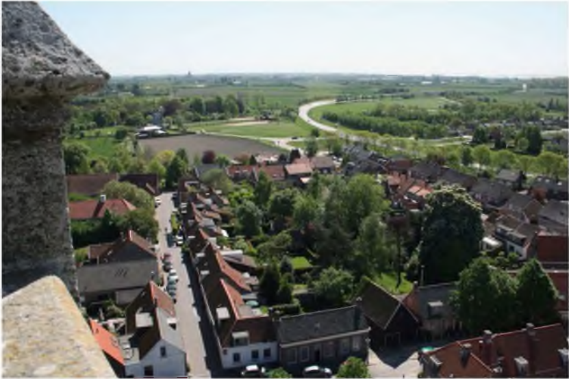
The village of Goes, in Zeeland, as seen from the church tower, today.

they came out at the ankles. But his heart could not be moved. Then the court convicted him and sentenced him to death.