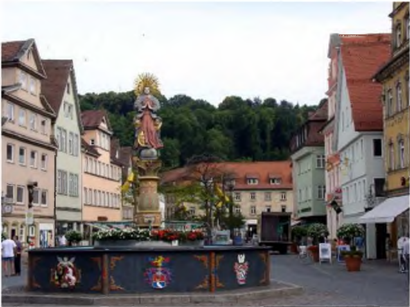
The Marienbrunnen (fountain of Mary) in the market place at Schwäbisch-Gmünd, whose miraculous benefits the Anabaptists disowned.

His voice above the sound of the drums was clear, and many could understand what he said: “Stand off from your sins! Turn to God! There is no other way to heaven than through the Lord Jesus Christ who died on the cross to redeem us!”