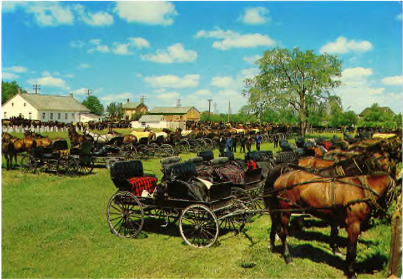
Two scenes from my home area , in the Waterloo Region, Ontario, Canada. An Old Order Mennonite meetinghouse (above) and the sign announcing a Canada Day picnic at an Ontario Conference Mennonite church (facing page).

past while peering anxiously at the new land that lies before us. Some of us rejoice. Others weep. We face an uncertain future. Do we have what we need?